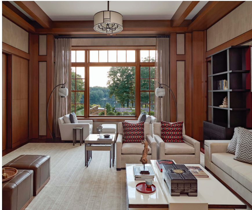
above left: A three-tiered coffee table sits on a cut-and-loop rug with a subtle stripe pattern. Hermès patterned pillows adorn the chairs to the left, and a custom mohair recliner sits to the right. above right: The view of the lake is framed by bronze-and-alabaster hanging lanterns set in front of leather draperies. opposite: Two vertical onyx-and-bronze sconces flank the fireplace, and a pair of chocolate leather ottomans with hand-stitched details sit in front. Off to the left is a high-gloss Macassar ebony desk.

FOREHAND + LAKE WITH CHARLES HILTON ARCHITECTS