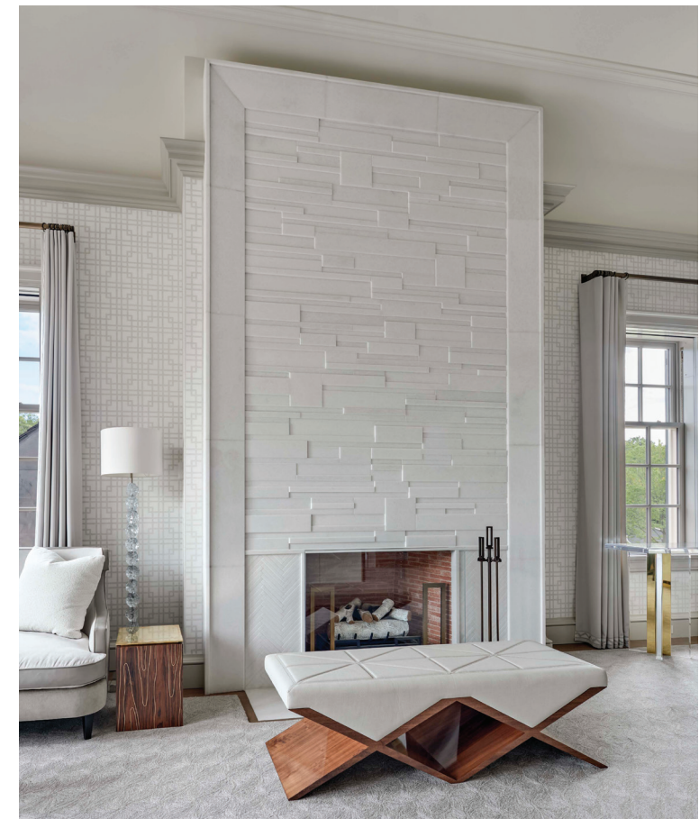
opposite page: A hand-stitched leather paneled niche perfectly frames and aligns with the bed and nightstands. this page: The room is grounded by a pale gray geometric wallcovering. A walnut bench with a hand-stitched shagreen cushion sits in front of the fireplace.