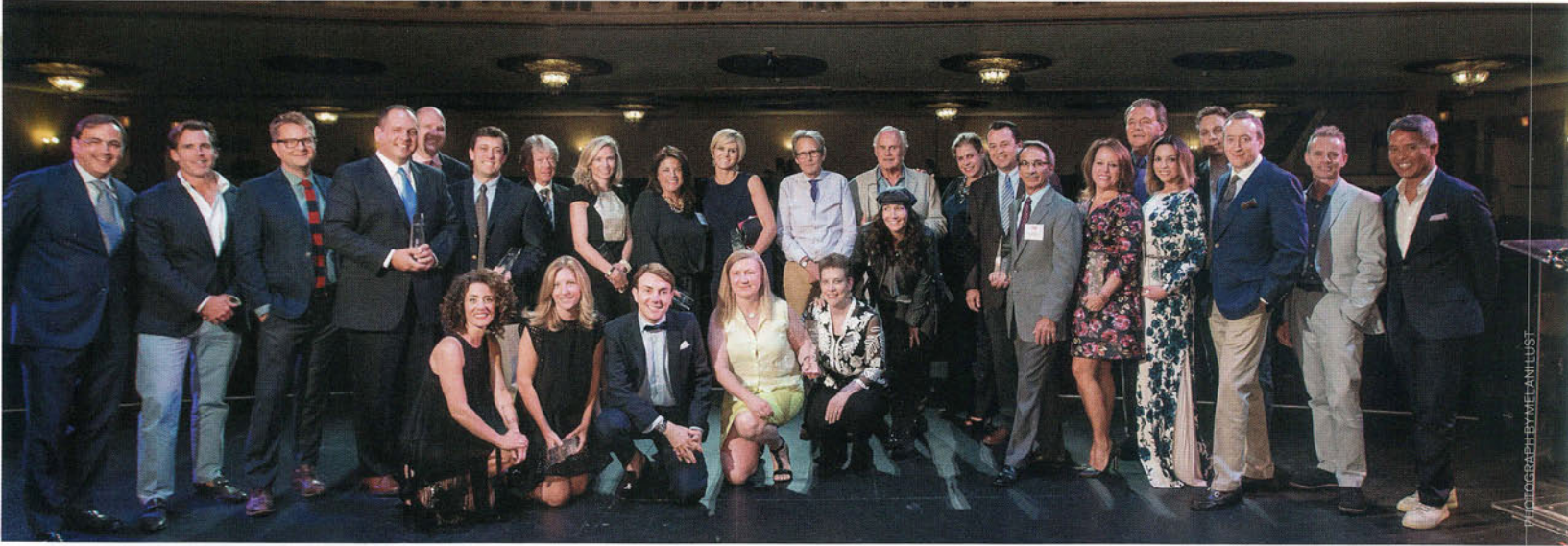
The 2014 A-List winners pose with our panel of judges post-awards show.