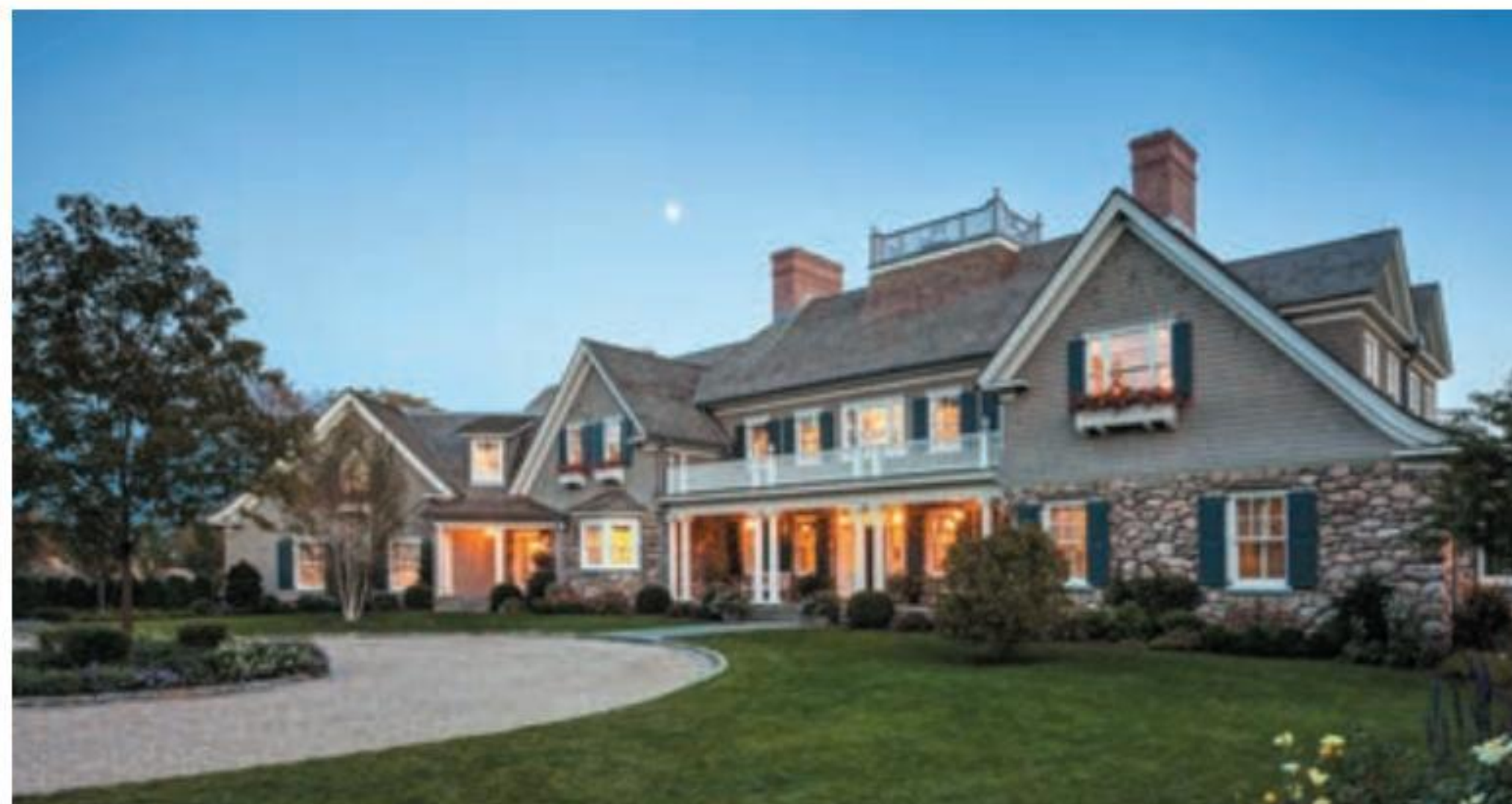
Excellence: New Construction & Commendation for Sustainability: NEW ENGLAND SHINGLE-STYLE RESIDENCE Architect: Charles Hilton Architects

Palatial and polished, this 10,000-square-foot estate overlooking Long Island Sound exudes quintessential New England charm with its shingled upper floor and fieldstone base. Charles Hilton Architects sited the Shingle-style house in a linear manner to capture coastal views while crafting a floor plan that maximizes circulation throughout the first floor and to the adjacent porches. Exquisite architectural detailing inside and out combined with state-of-the-art systems and technology equals a home that scores major points for both style and sustainability.