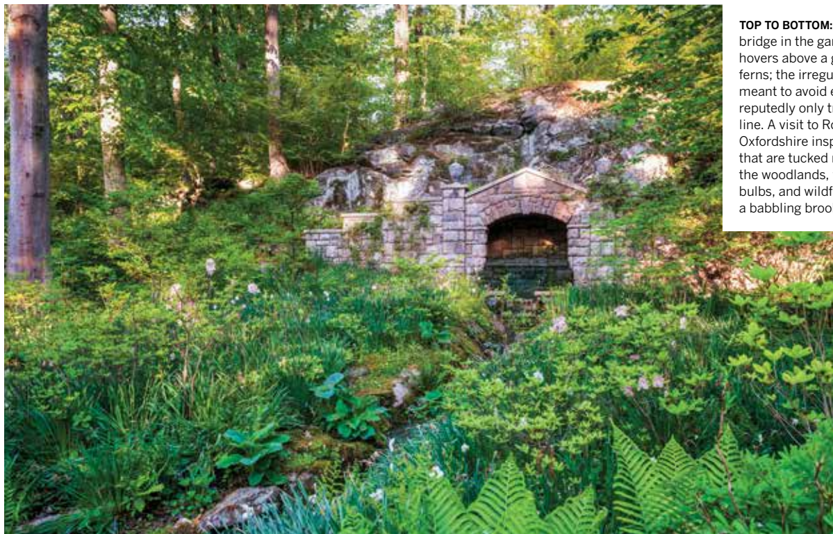
TOP TO BOTTOM: The zigzag bridge in the garden's Spirit Walk hovers above a glade of irises and ferns; the irregular pathway is meant to avoid evil spirits, which reputedly only travel in a straight line. A visit to Rousham House in Oxfordshire inspired the grottos that are tucked romantically into the woodlands, while azaleas, bulbs, and wildflowers follow a babbling brook.