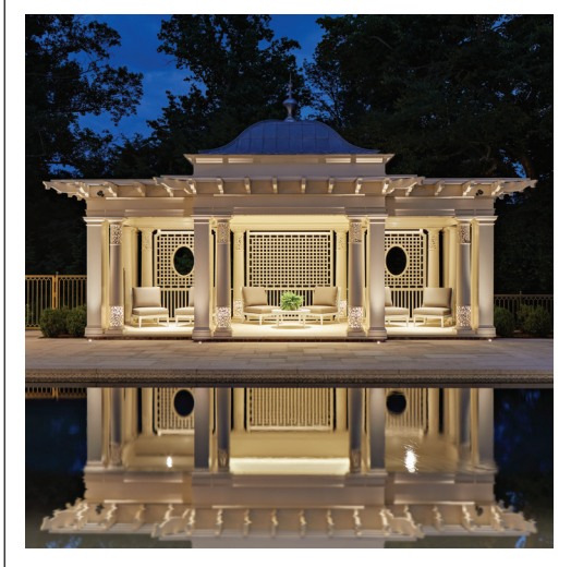
above : A poolside pergola designed by Hilton is an elegant escape.

Whether overlooking Long Island Sound, situated alongside a picturesque lake, nestled in the verdant countryside or positioned steps from the bustling heart of downtown, Hilton's projects all feature custom details that evoke a sense of place. He works in traditional vocabularies with a focus on exquisite classical detailing, but his houses are also completely